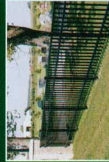
UAF-200 Flat Top, 48" High