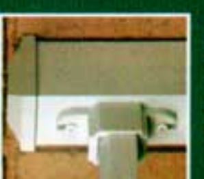
Rail End Mount