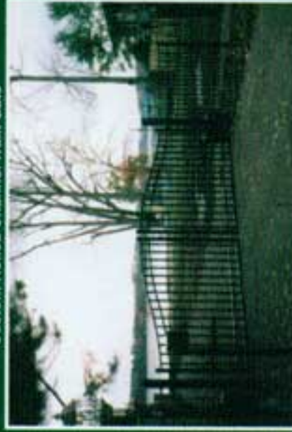
UAF-200 Flat Top Custom Rolled Channel Gate