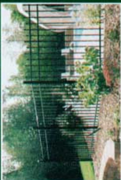
UAS-150, 60" High Modified, Staggered Spear