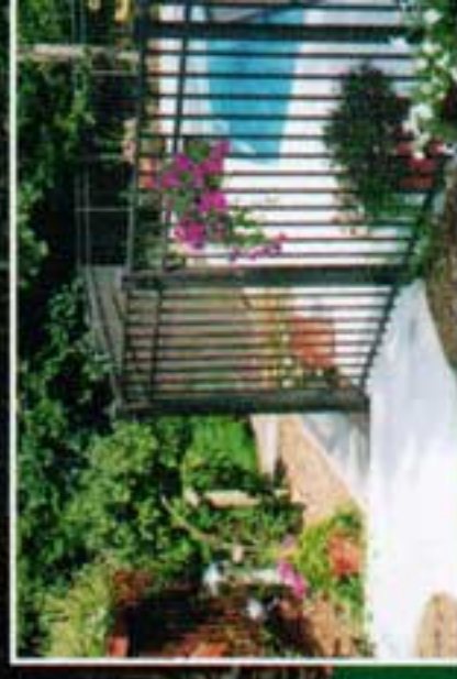
UAF-200 Flat Top, 48" Modified