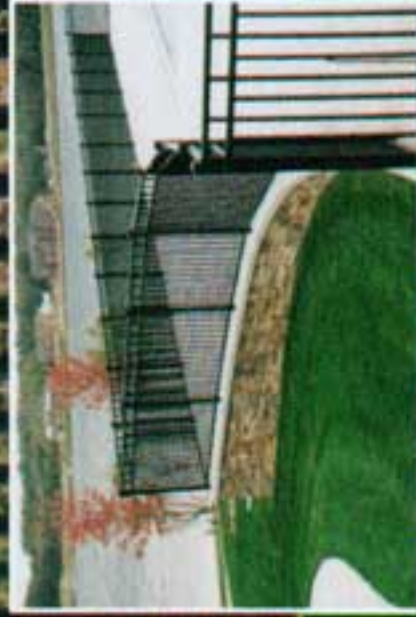
UAF-200 Flat Top Flush, 48" Special Design