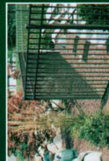
UAF-200 Flat Top, 54" Modified