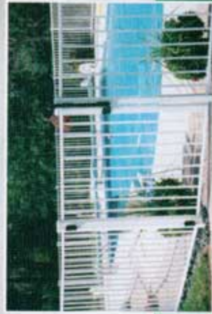
UAF-200, 2-Rail Flush Flat Top (welded)