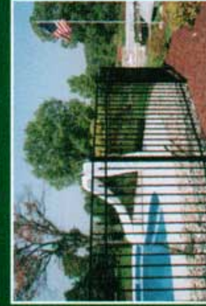
UAF-250 Flat Top with Spear, 54" Modified