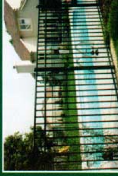
UAF-200 Flat Top, 54" Modified