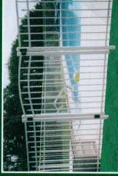
UAF-250 Flat Top with Spear, 54" Modified Custom Rolled Channel Walk Gate