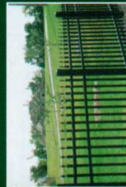
UAS-100 Spear Top, 48" High with Tri-Finials & 3" Posts