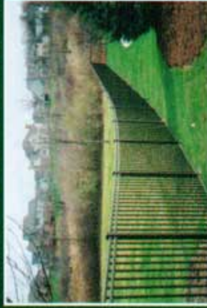
UAB-200, 48" High 3-Rail