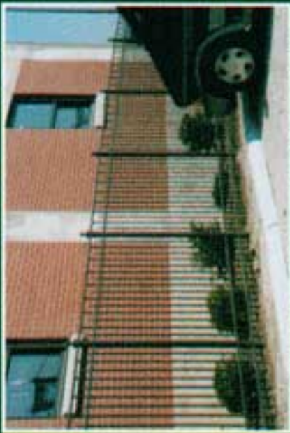
UAF-250 Flat Top with Spears & Ball Tops, 72" High