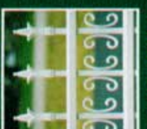
Tri-Finials with Butterflies