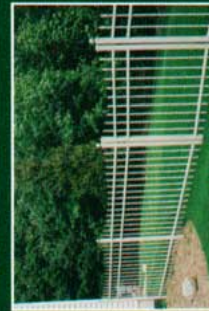
UAS-300, 48" Spear with Ball Tops