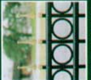
Circles with Gold Quad-Finial