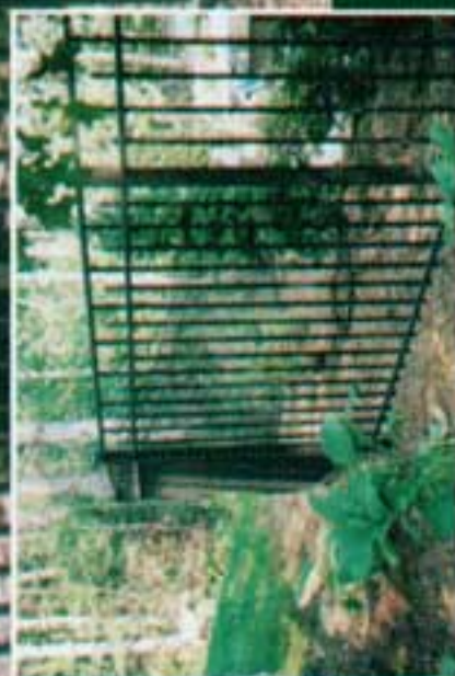
UAF-250 Flat Top with Spear, 54" Modified