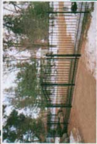
UAF-250 with Short Spears, Custom Rolled Channel Gate