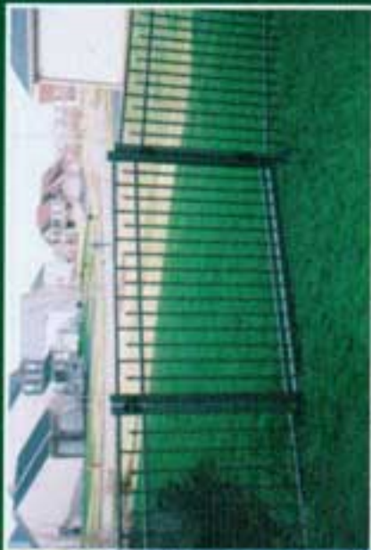
UAF-250 Flat Top with Spear, Welded U-Frame