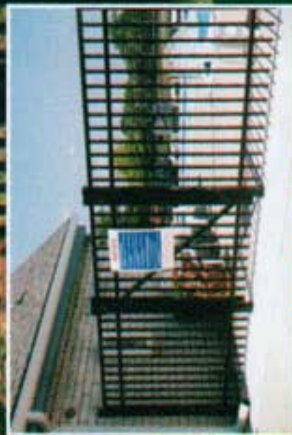
UAF-200 Flat Top, 60" High