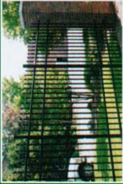
UAS-100 Spear Top, 64" High