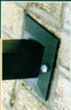
2 Piece Wedge Flange