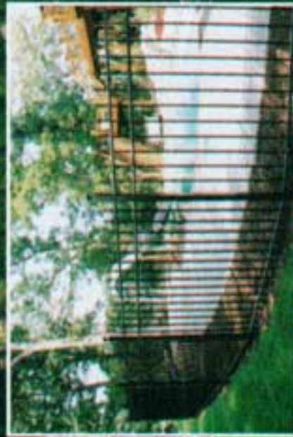
UAS-100 Spear Top, 60" Modified