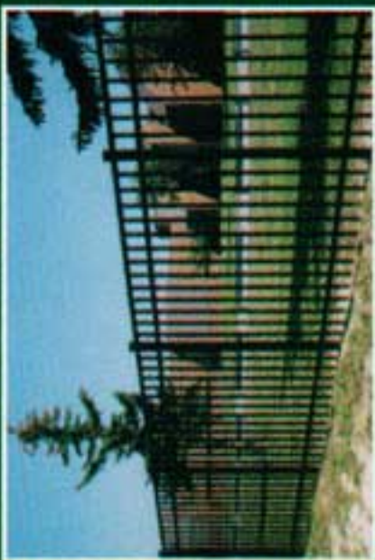
UAF-200 Flat Top, 72" High