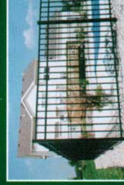
UAF-200 Flat Top, 54" Modified