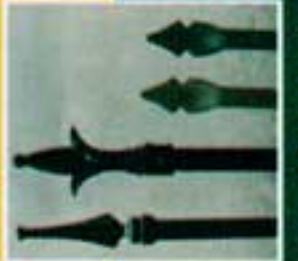
Quad-Finial, Tri-Finial, and Standard Finial