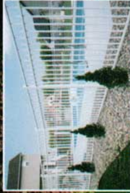
UAF-250 Flat Top with Spear, 54" High