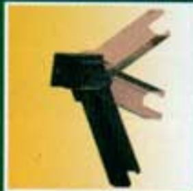
Horizontal Adjustable Rail End