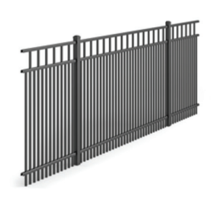
UAF 201 FLAT TOP

3-Rail fence with spear top pickets between mid and top rail.