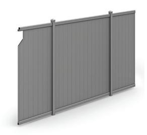
ULTRA ECLIPSE™ ALL ALUMINUM PRIVACY

Eclipse Air™ offers privacy with the strength of aluminum posts, rails and welded louvers, along with a nice breeze.