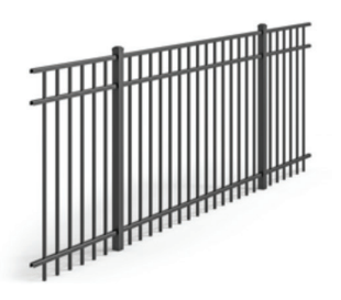
UAF 200 FLAT TOP

Our line of low-maintenance, high-quality ornamental aluminum picket fencing is a great alternative to traditional wrought-iron fence. Ultra Aluminum Fencing offers a complete line of handsome, durable, easy-care styles in Residential, Commercial, Pool Fencing, and Industrial grades, as well as a three different styles of Privacy Fence. Visit www.ultrafence.com for the complete story.