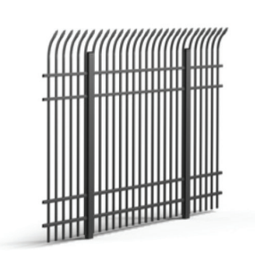
UAD 100 DEFENDER SPEAR TOP

3-Rail fence with spear top pickets in convex formation above top rail.