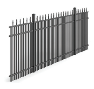
UAS 101 SPEAR TOP

3-Rail fence with staggered-height spear top pickets above top rail.