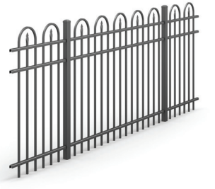
UAL 100 LOOP TOP

3-Rail fence with spear top pickets inside looped pickets.