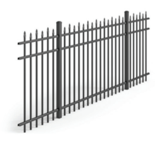
UAS 150 STAGGERED SPEAR

3-Rail fence with spear top pickets above top rail.