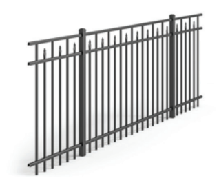
UAF 250 FLAT TOP W/SPEAR

3-Rail aluminum fence with flat top rail.